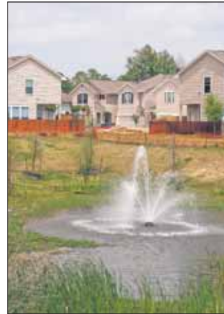
FOUNTAIN OF YOUTH:

Buyers have been motivated in part by the tax credits offered by the national government, Bancroft said. The makeup of the neighborhood is diverse, with most homeowners being well-educated workers in the teaching, accounting and engineering fields. The average price of the home is around $200,000.