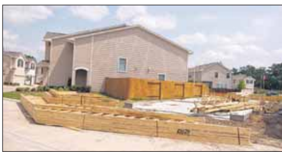
UNDER CONSTRUCTION: The development company is selling three to four town homes each month. Thirty of the 70 remain unsold at the moment.

Developer builds affordable town home gated community in popular subdivision